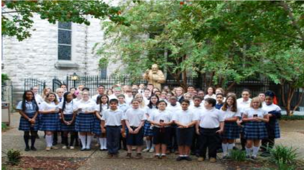
Middle School students at Immaculate Conception on a recent visit to see the St. Maria Goretti relics.

We Resurrection Parish Catholic School are a diverse community committed to forming a Christ-centered environment that fosters academic excellence and lifelong Gospel values."