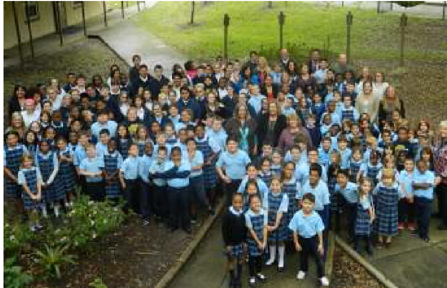
Resurrection Rocks 2015-2016!

"We Resurrection Parish Catholic School are a diverse community committed to forming a Christ-centered environment that fosters academic excellence and lifelong Gospel values."